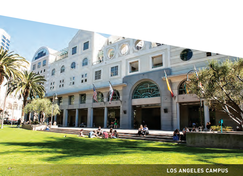
LOS ANGELES CAMPUS